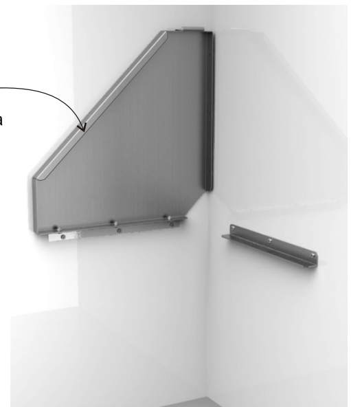
3/4 view, up position