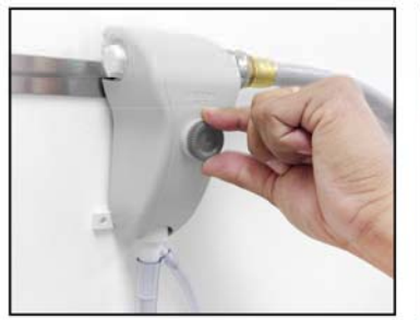
Push button activator with a simple twist to lock in