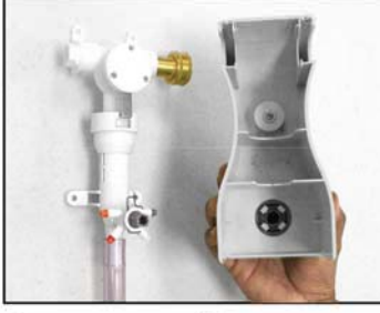
Cover snaps off for easy installation and servicing.