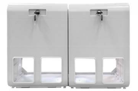
Dual Cabinet with locks

The Storage Cabinet is a modular chemical cabinet that is designed to fit your storage needs. The storage cabinet can be customized into multiple chambers or configurations to be used with as many chemical containers as needed. The rugged enclosure is made of an ABS plastic with reinforced ribbing. The cabinet is made to fit 1 gallon, 5 liter, or two 1/2 gallon F-style containers. The cabinets can be ordered with a dispenser mounting easel to mount single product dispenser, dial-4 dispenser, 5 product, or 8 product dispensers.