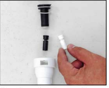
A unit can be changed from a 3.8 LPM unit to a 15.2 LPM unit with a switch of the venturi.