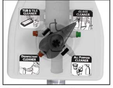
Suction ports match directional dial for easy chemical installation