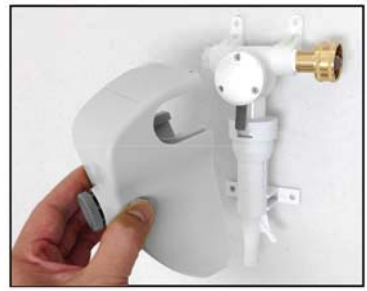
Cover can be removed from dispenser without tools for easy servicing