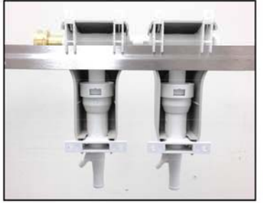
Optional joggle bracket (19 cm or 29 cm) available to for simple mounting and servicing