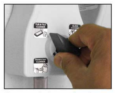
Ergonomic, large direction selector dial with pronounced clicking action for intuitive operation.