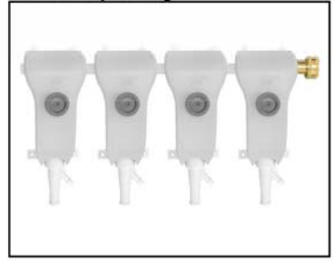
As many units as you need can be daisy chained together with optional connectors