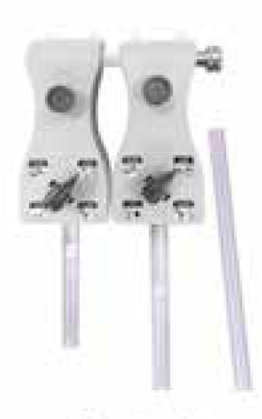
Four Product Bottle Fill & Four Product bucket fill