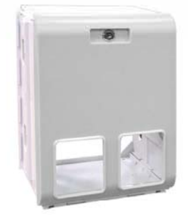
Single Cabinet with locks