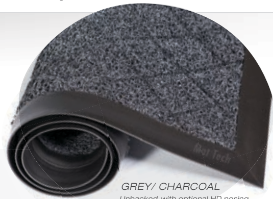
GREY/ CHARCOAL Unbacked with optional HD nosing