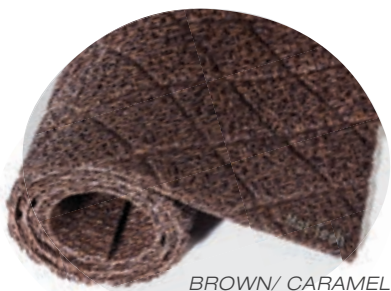
BROWN/ CARAMEL Unbacked