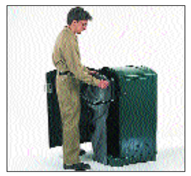
Standard slide-out bag holder eases installation and removal of polyliner bag.