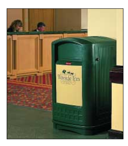
Customize your Plaza™ Container to make a bold public impression with multi-color screen imprinting on the front and back of the Plaza™ Container.