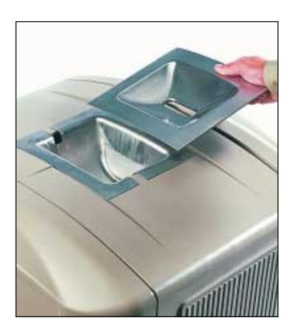
Stainless steel ash tray version features two-piece construction for easy cleaning.