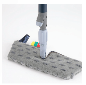
Swep - Market leading preprepared mopping.