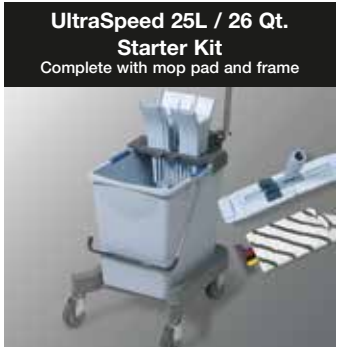
General cleaning Detachable chassis for easy filling