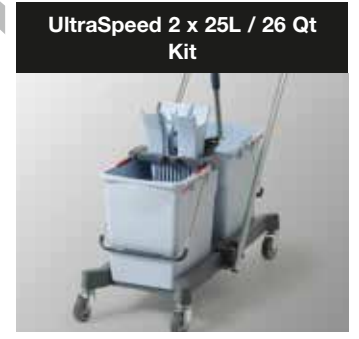
Double bucket solution for optimum cleaning results