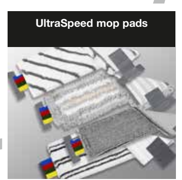
A wide variety of microfiber dry, damp and wet mops