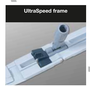
Light (425g / 15 oz.) durable 40 cm/16" break away frame can be used with standard pocket mops