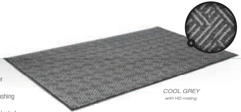
COOL GREY with HD nosing