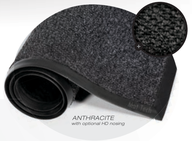
ANTHRACITE with optional HD nosing