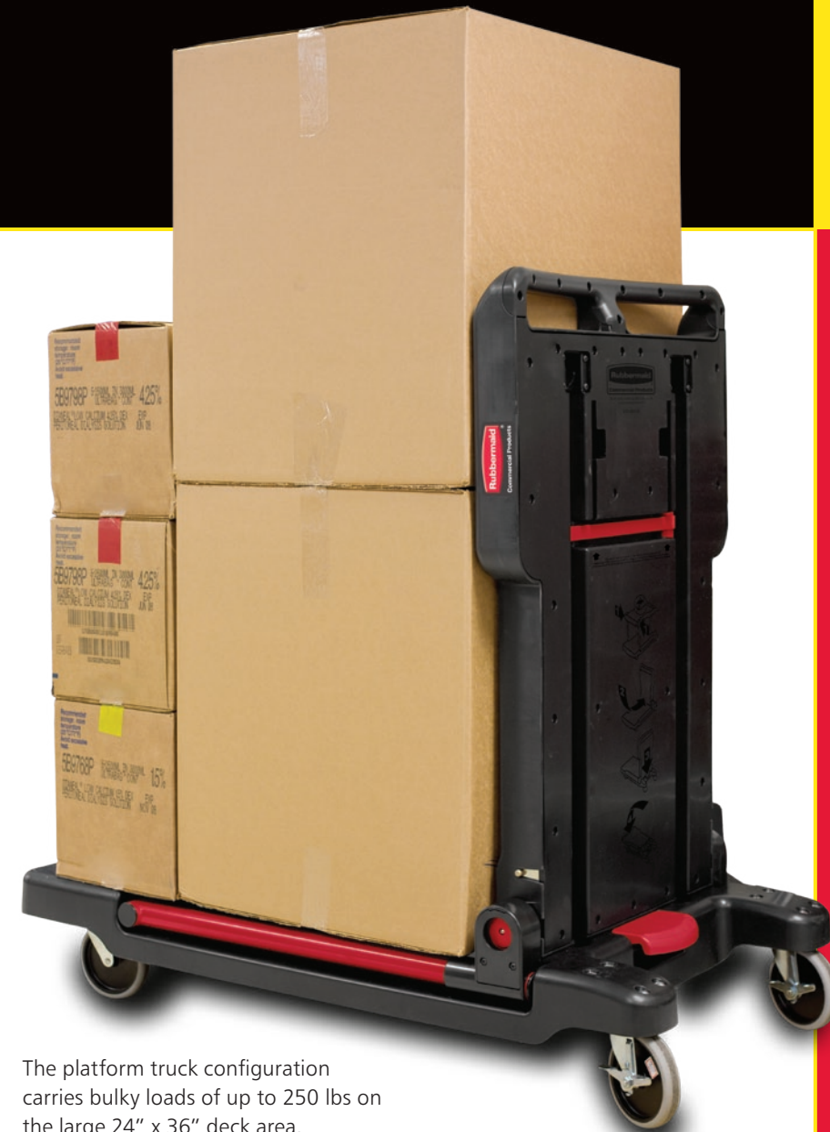
The platform truck configuration carries bulky loads of up to 250 lbs on the large 24" x 36" deck area.