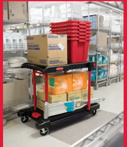
The utility cart configuration holds up to 400 lbs. The extended bottom shelf makes loading easier and helps reduce worker strain.

The patent-pending design of the Convertible Utility Cart increases productivity and helps improve worker well-being.