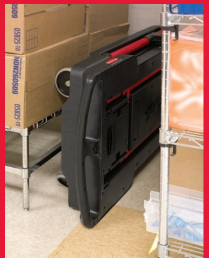
The Convertible Utility Cart folds to just 10 7 / 8 " high for efficient storage and transport.