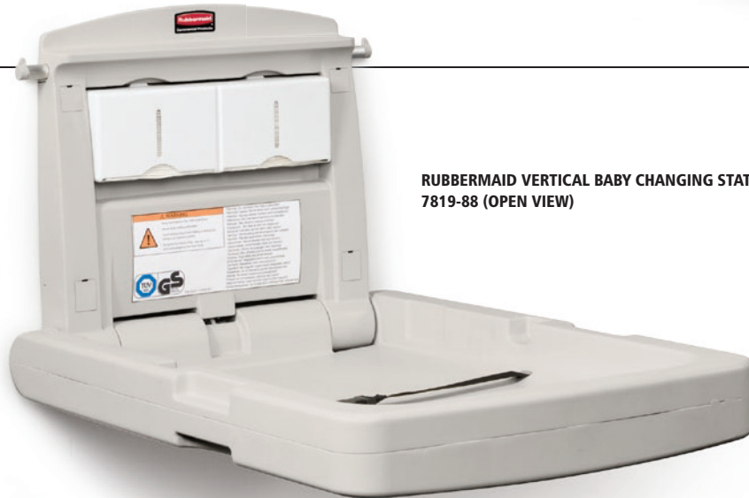
RUBBERMAID VERTICAL BABY CHANGING STATION 7819-88 (OPEN VIEW)