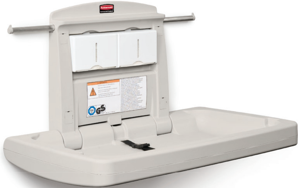
RUBBERMAID HORIZONTAL BABY CHANGING STATION 7818-88 (OPEN VIEW)