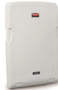
RUBBERMAID VERTICAL BABY CHANGING STATION 7819-88 (CLOSED VIEW)