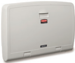
RUBBERMAID HORIZONTAL BABY CHANGING STATION 7818-88 (CLOSED VIEW)