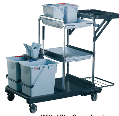
With UltraSpeed wringer