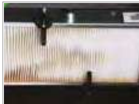
ELECTRIC FILTER SHAKER