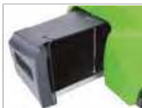
LARGE FRONTAL WASTE TRAY