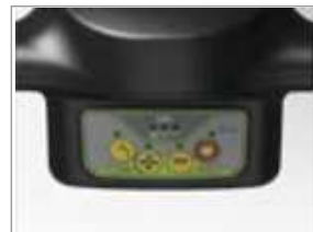
EASY TO USE CONTROLS