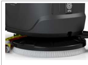
SPIN-ON, SPIN-OFF BRUSH