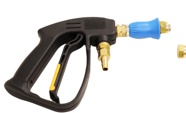
Spray Gun- with two tips (.0025 & .01) for flexibility in amount of disinfectant needed