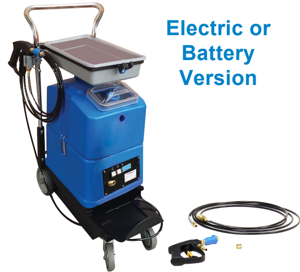
TP4X/XP Mister (shown with optional cart)