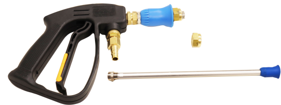
Optional 16" Spray Gun Extension