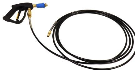
17' Solution Hose