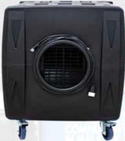
12" Exhaust Collar