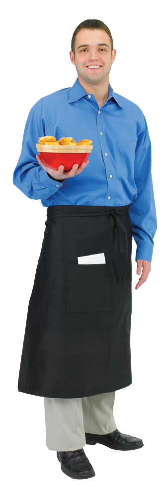
When you need to look good.

These premium quality aprons are made from heavyweight material and have extra long self-ties to make you look and feel your best.