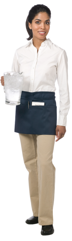
When you need simplicity.

It has pockets. It looks good. It's short. It's as simple as that.