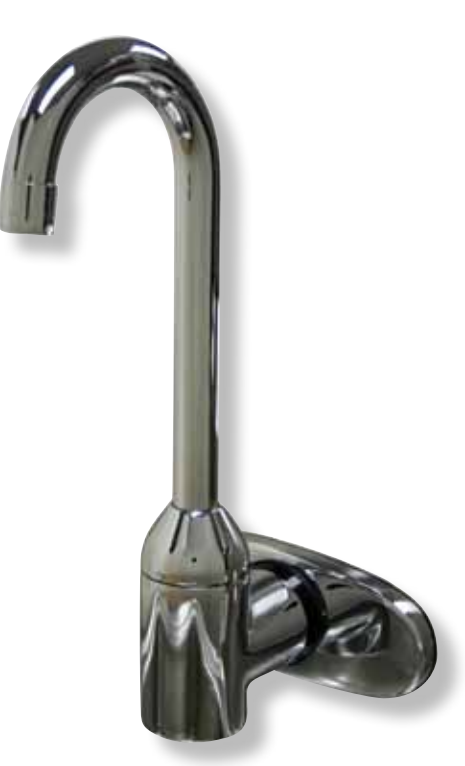
Venetian Gooseneck 3.5 or 5.5 inch wall mount