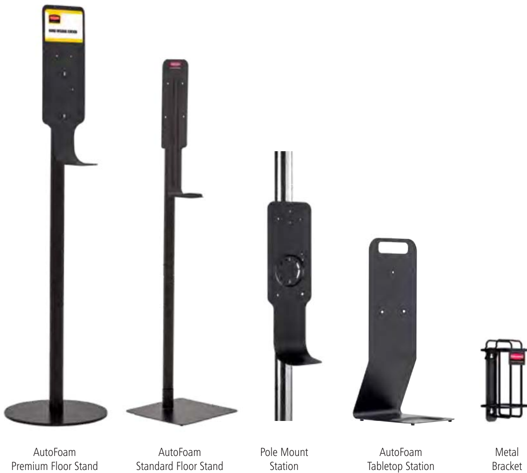
AutoFoam Premium Floor Stand