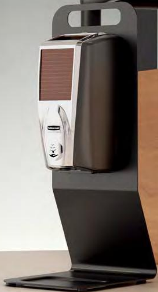
1980826 / 2143544