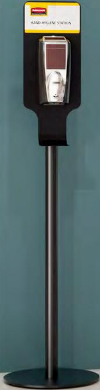
1980826 / FG750824