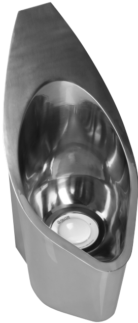
WATERFREE URINAL STAINLESS STEEL