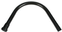
Wands (Various Shapes & Lengths)