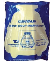
Filters & Bags