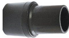
Hoses & Ends