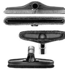
Smooth Surface Tools