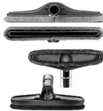
Smooth Surface Tools