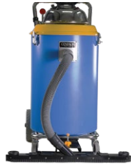
26" Front Mount Squeegee