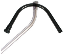
Wands (Various Shapes & Lengths)