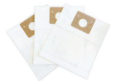
Filters & Bags