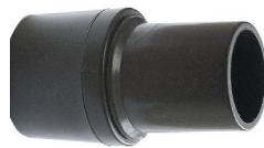
Hoses & Ends