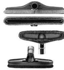
Smooth Surface Tools