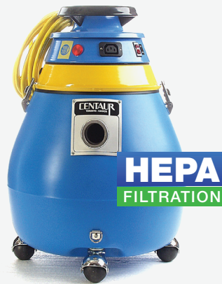
Silento-300 20 L Dry Vacuum #1W12027