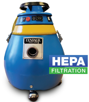
Silento-310 20 L Dry Vacuum #1W12029