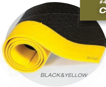
BLACK &amp; YELLOW