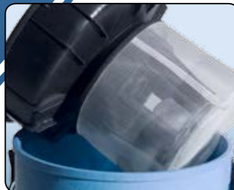
Giant wet and dry primary basket filter