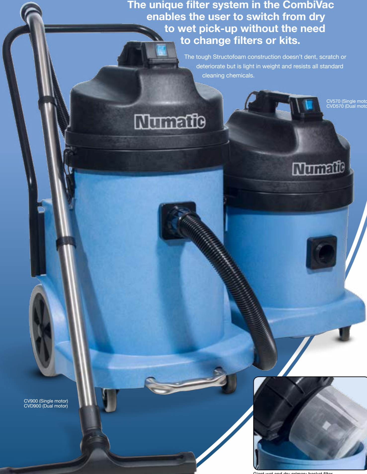
CV900 (Single motor) CVD900 (Dual motor)