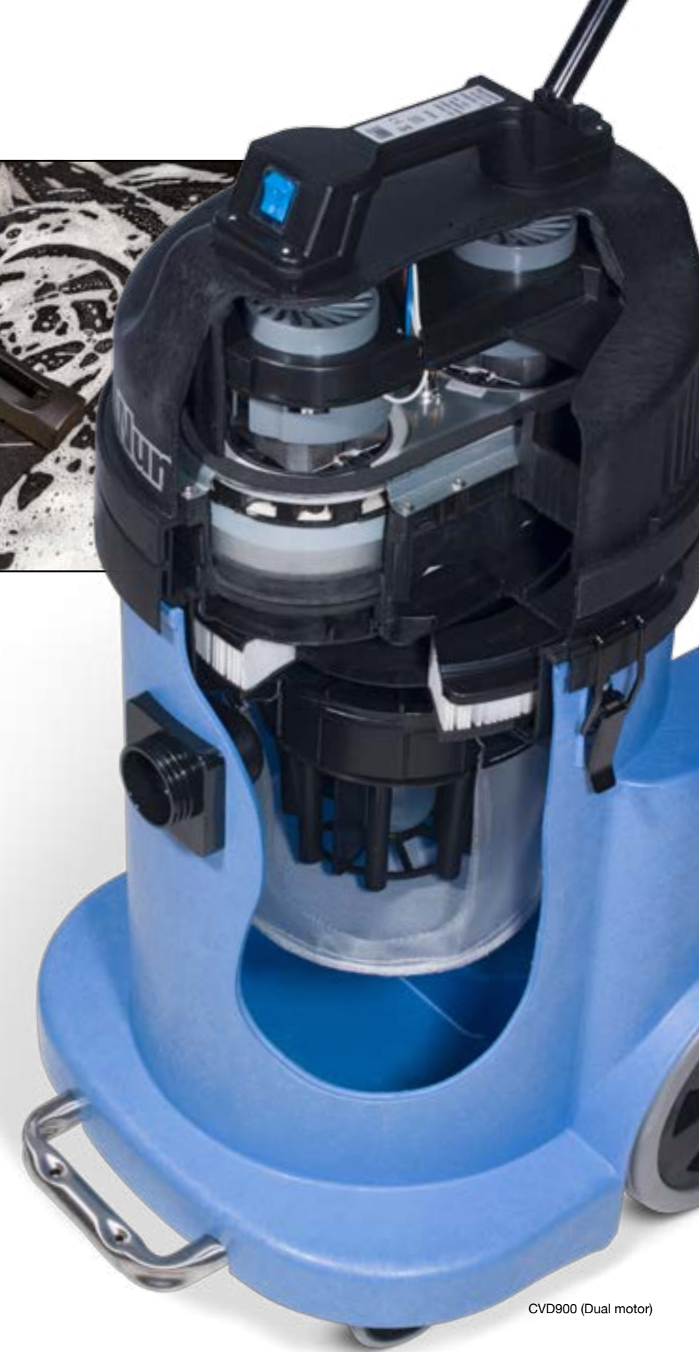
CVD900 (Dual motor)