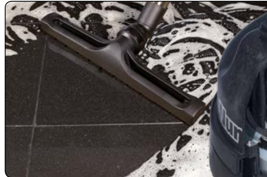
Clean, dry floors again and again