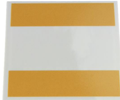
Adhesive Back All Units