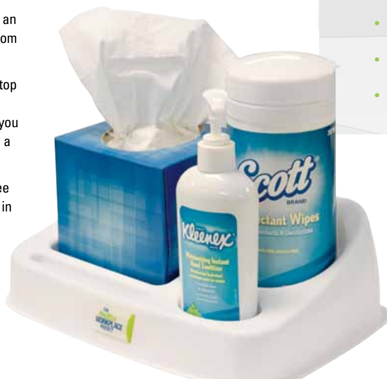
Standard Desk Caddy »