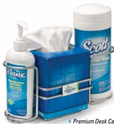
« Premium Desk Caddy