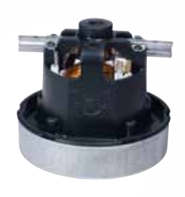
2,250+ hour 680 watt vacuum motor