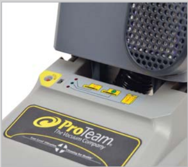
LIGHTED DISPLAY alerts user to full filter, brush roller on or jammed brush roll

Our top-of-the-line ProForce uprights have evolved into superior cleaning machines. ProForce uprights provide exceptional cleaning in a high filtration upright to improve reach, durability, and Indoor Air Quality. The dual motor system and exhaust filters made from HEPA media maximize efficiency and effectiveness. The powerful ProForce contains a high-performance dual motor system and a low profile, L-shaped head perfect for vacuuming under around furniture.