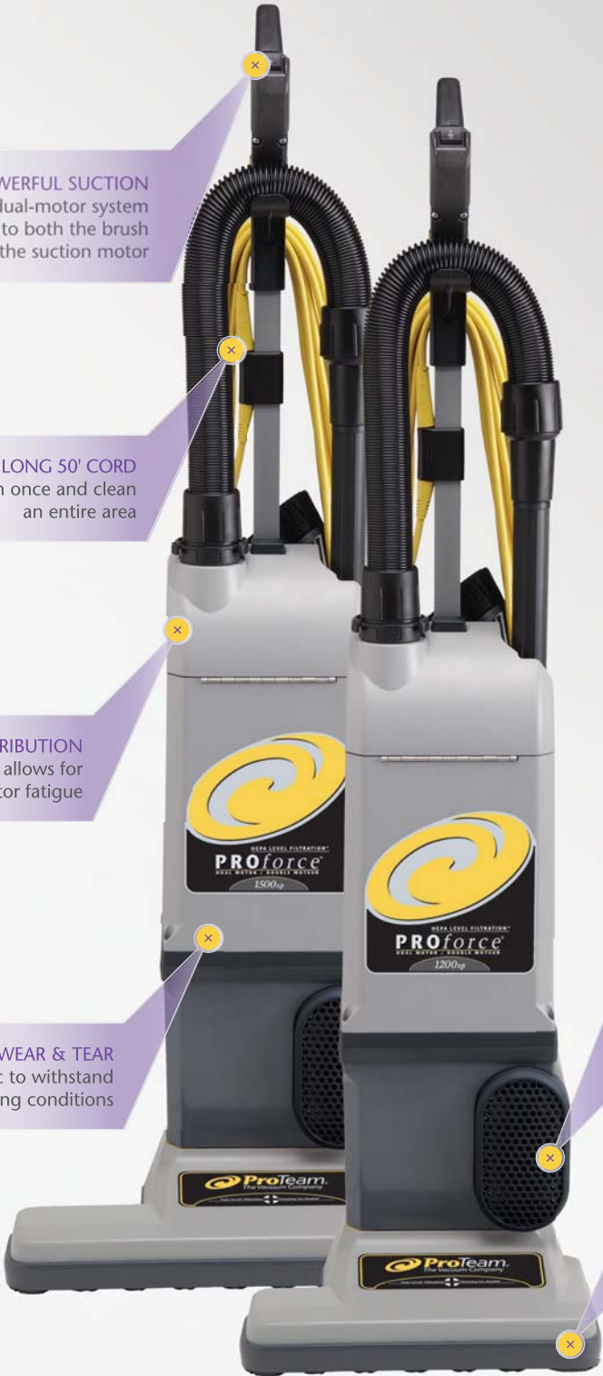
VERSATILITY the 12" powerhead can reach even smaller spaces (PF 1200XP)