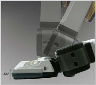
INNOVATIVE DESIGN low profile, L-shaped head perfect for vacuuming under and around furniture and across different types of flooring