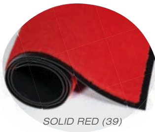
SOLID RED (39)