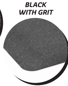
BLACK WITH GRIT