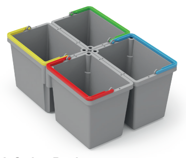
5L Swing Bucket Without Lid

Deep Storage Box (per 10) Red / Blue / Green / Yellow