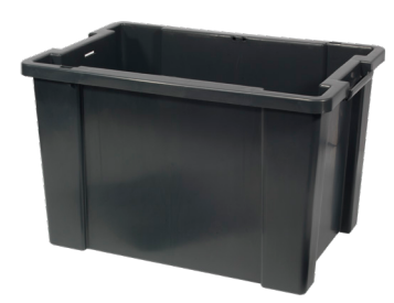
Rolling Deep Bin