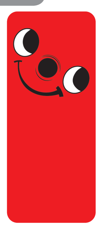
Door Graphic Set Happy Cleaning