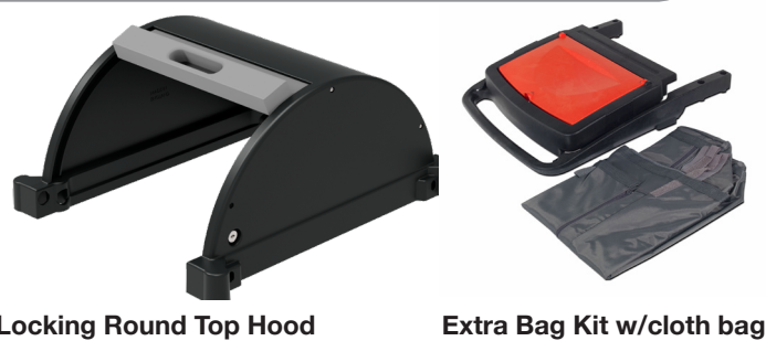
Locking Round Top Hood