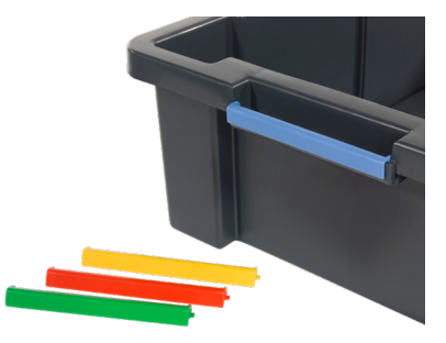
Clip-on Colour Strips

Deep Storage Box (per 10) Red / Blue / Green / Yellow