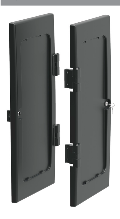
Door Kit SRK20 C/W Locks and Hinges