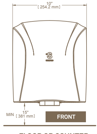
FLOOR OR COUNTER