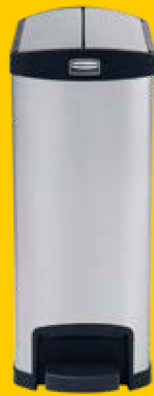
1901993 END STEP