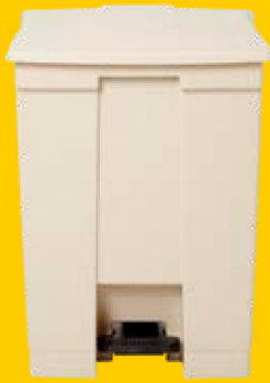
FG614500BEIG 18 GAL