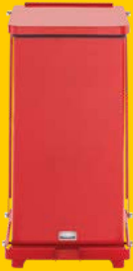
FGST12EPLRD 6.5 GAL