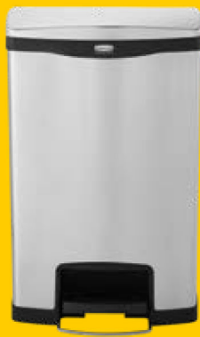
1901992 FRONT STEP