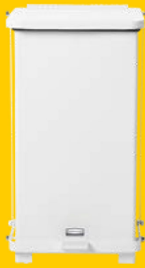
FGST12EPLWH 6.5 GAL