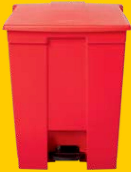
FG614500RED 18 GAL