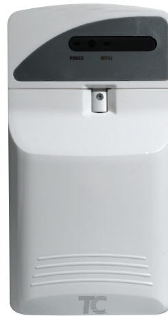
TC Pump LED 400695