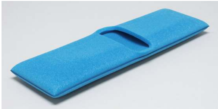
22-34 TruCLEAN Sponge Mop