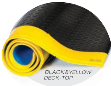
BLACK & YELLOW DECK-TOP

FOR MORE INFO: mattech.ca/wdtractionplus