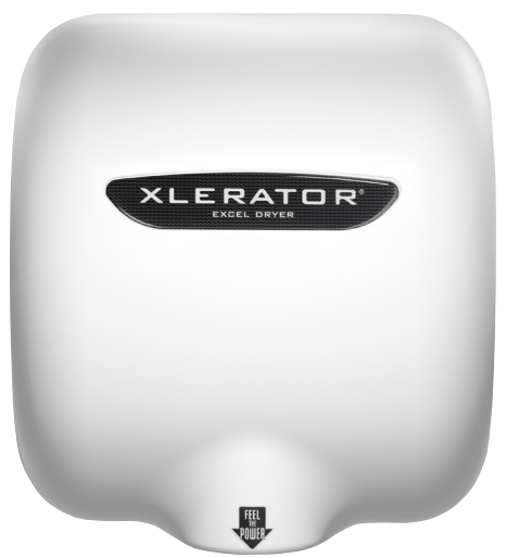
XL-BW White Thermoset Resin (BMC)